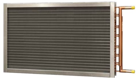
Heating & Cooling coils