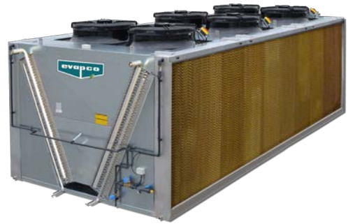
Heating & Cooling coils