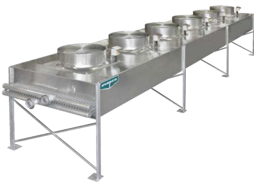
Industrial Dry Coolers & Condensers